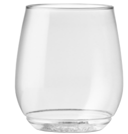
TUMBLER / VINO PET, Stackable

Item No. 0398018 Capacity 532ml Max. Dia 92mm Height 109mm