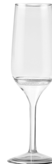
MINI CHAMPAGNE FLUTE WITH STEM PET, Stackable

Item No. 0398106 Capacity 177ml Max. Dia 55mm Height 99mm