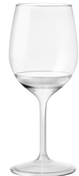
VINO WITH STEM PET, Stackable

Item No. 0398012 Capacity 355ml Max. Dia 82mm Height 85mm