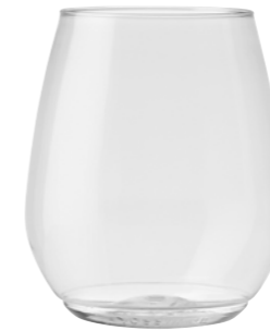
TUMBLER / VINO PET, Stackable

Item No. 0398018 Capacity 532ml Max. Dia 92mm Height 109mm