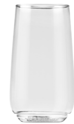
MINI CHAMPAGNE FLUTE PET, Stackable

Item No. 0398109 Capacity 266ml Max. Dia 57mm Height 146mm