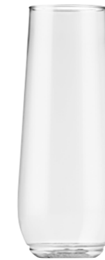
CHAMPAGNE FLUTE PET, Stackable

Item No. 0398109 Capacity 266ml Max. Dia 57mm Height 146mm