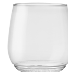
TUMBLER / VINO PET, Stackable

Item No. 0398014 Capacity 414ml Max. Dia 84mm Height 95mm