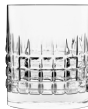
DOUBLE OLD FASHIONED ◇

Item No. CC6512418 Capacity 480ml Max. Dia 74mm Height 157mm