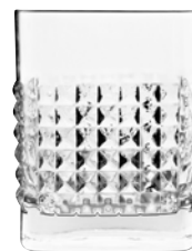
DOUBLE OLD FASHIONED ◇

Item No. CC6512419 Capacity 480ml Max. Dia 73mm Height 157mm