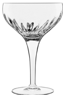
COUPE COCKTAIL ◇

Item No. CC6512460 Capacity 225ml Max. Dia 95mm Height 140mm