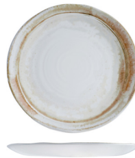
ORGANIC COUPE PLATE ★