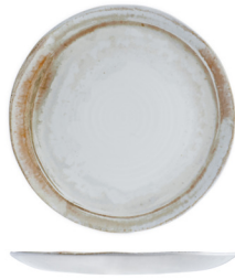
ORGANIC COUPE PLATE ★