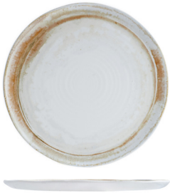
ORGANIC FLAT PLATE