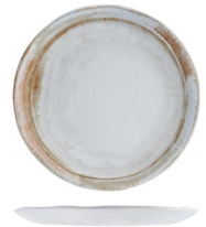
ORGANIC COUPE PLATE ★