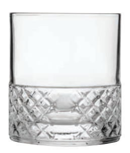
DOUBLE OLD FASHIONED \diamondsuit

Item No. CC6512764 Capacity 400ml Max. Dia 70mm Height 142mm