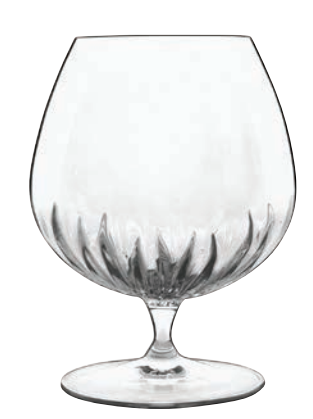
COGNAC ♦ Item No. CC6512724 Capacity 465ml Max. Dia 97mm Height 127mm