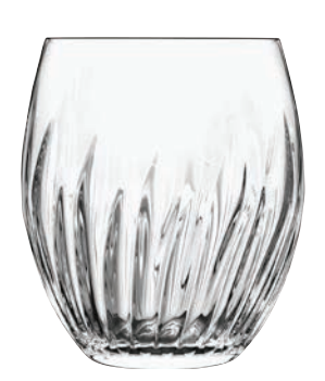
COCKTAIL ICE ♦ Item No. CC6512648 Capacity 500ml Max. Dia 94mm Height 104mm