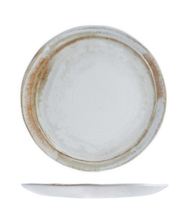
Item no. 991311-S ★ ORGANIC COUPE PLATE Diameter 290mm