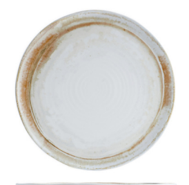
Item no. 991312-S ★ ORGANIC FLAT PLATE Diameter 318mm

Item no. 991340-L ORGANIC COUPE BOWL Diameter 250mm Capacity 800ml